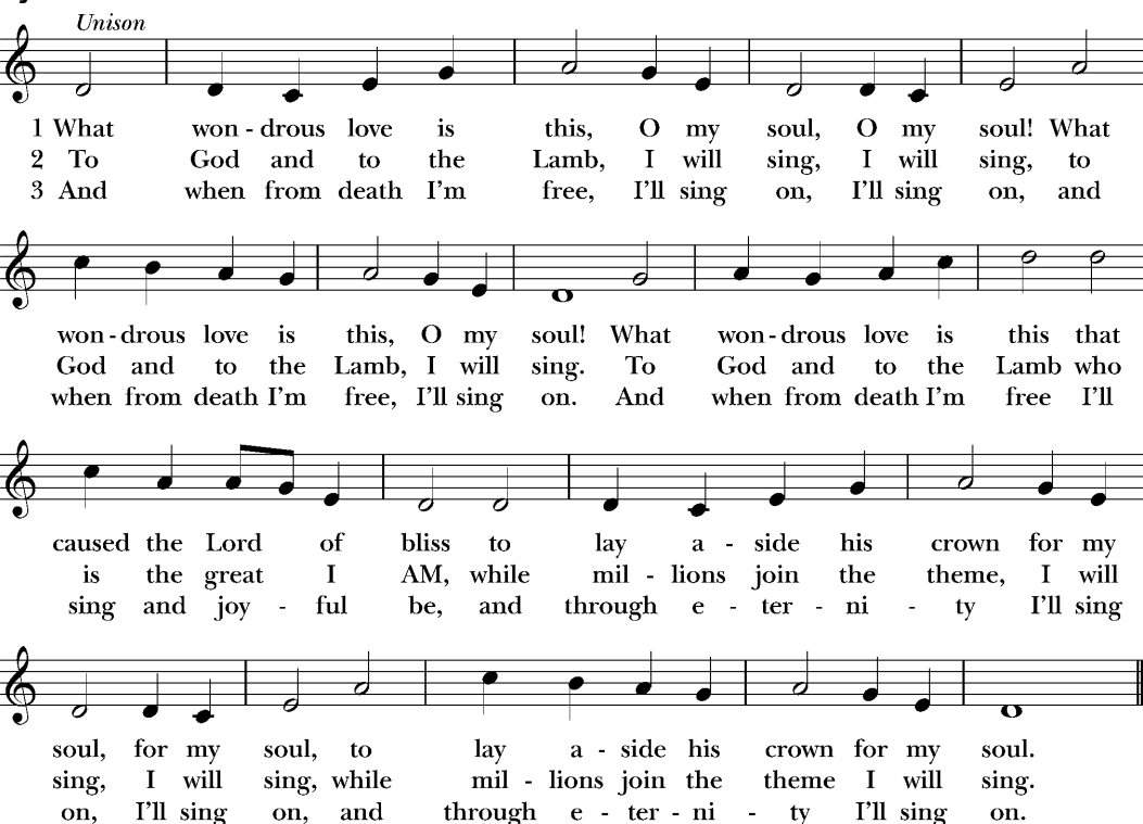
Hymn 439 | What wondrous love is this

Website at marymagdaleneanglican.net; Venmo to @Mark-Lieske; Zelle to mark@marymagdaleneanglican.net