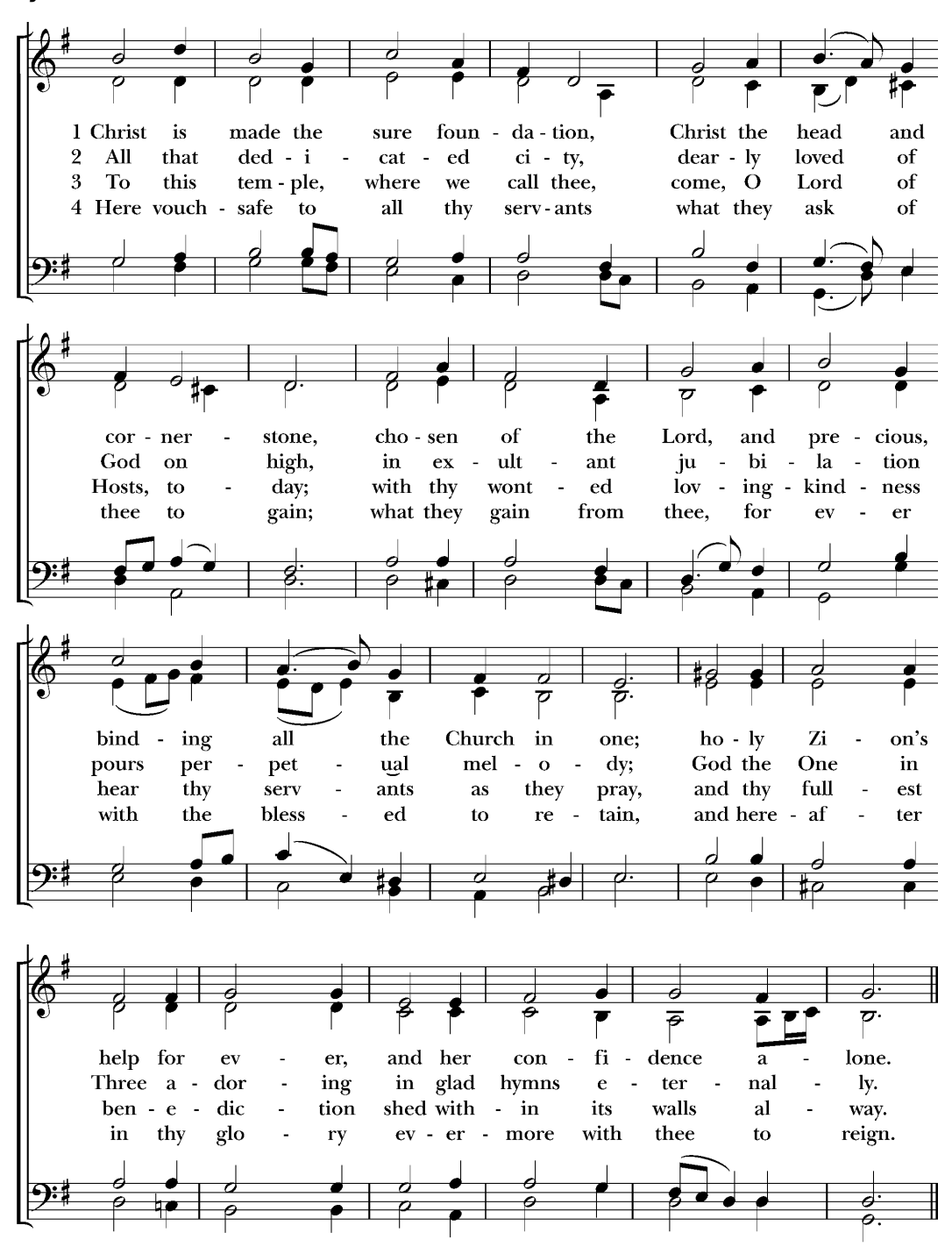
Hymn 518 | Christ is made the sure foundation