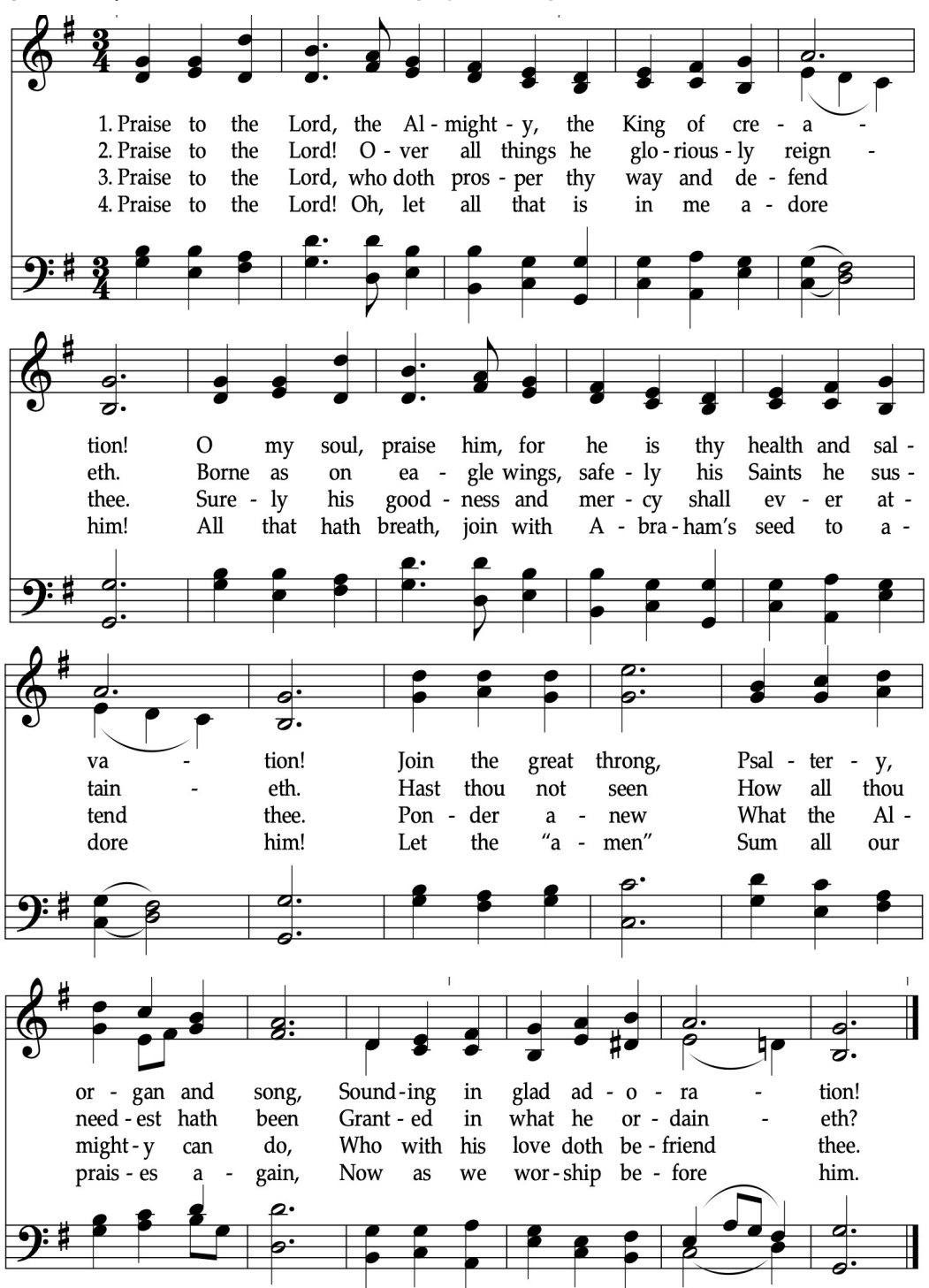
Hymn 390 | Praise to the Lord, the Almighty, the King of Creation

God's Blessing be with you, Christ's peace be with you, the Spirit's outpouring be with you, now and always. Amen.