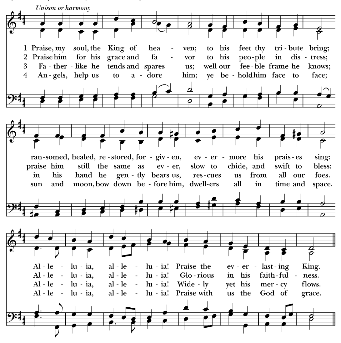
Hymn 410 | Praise, my soul, the King of heaven